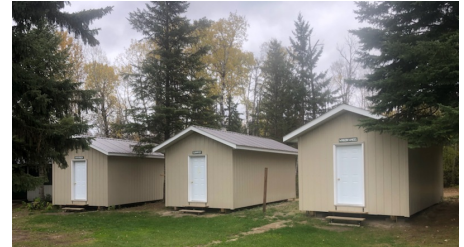
Our three new girls' cabins